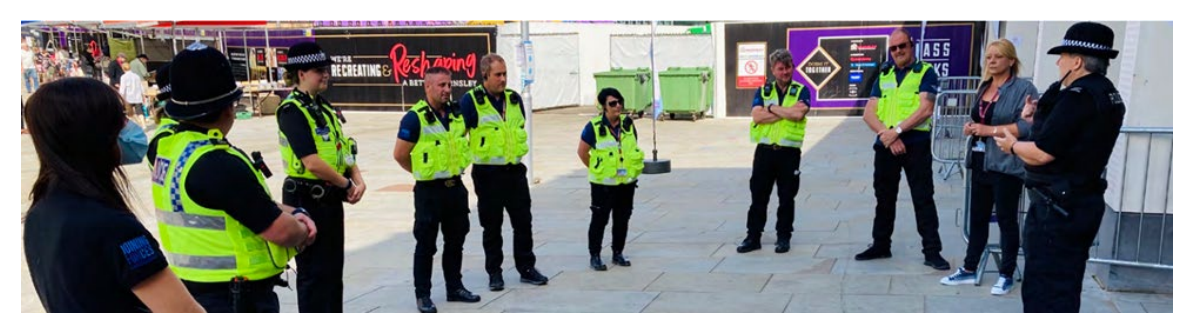
Page 13 of 15

This partnership plan aligns to the South Yorkshire Police and Crime Plan. Its priorities are updated every year to make sure any emerging trends from the JSIA are factored into future years' delivery.